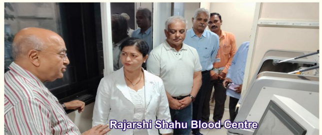
Rajarshi Shahu Blood Centre