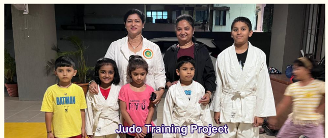
Judo Training Project