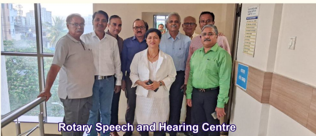
Rotary Speech and Hearing Centre