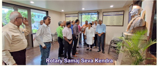
Rotary Samaj Seva Kendra