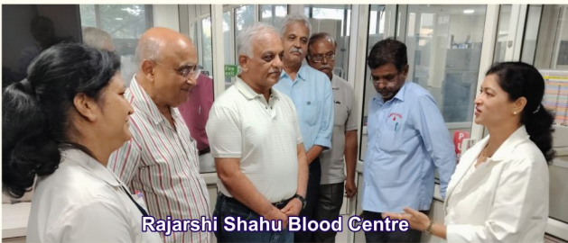
Rajarshi Shahu Blood Centre