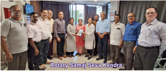
Rotary Samaj Seva Kendra