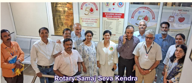
Rotary Samaj Seva Kendra