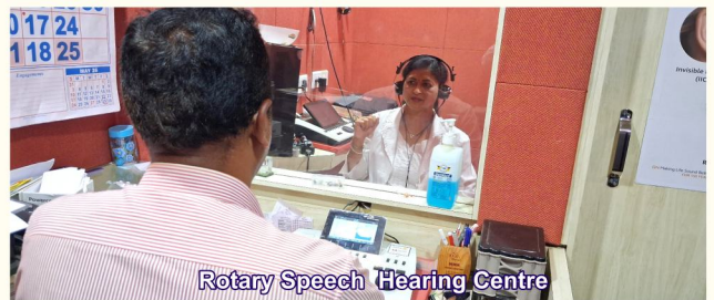
Rotary Speech Hearing Centre