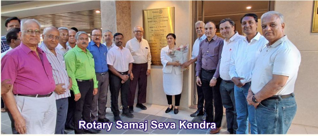
Rotary Samaj Seva Kendra